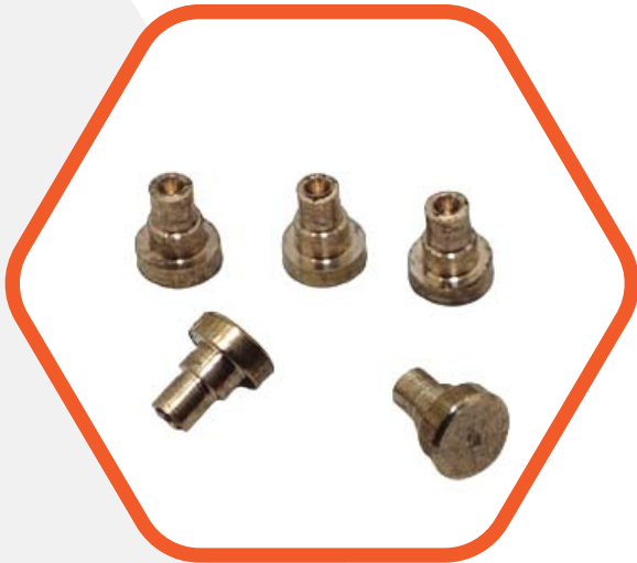
Link Rivet Platted 3 mm Round