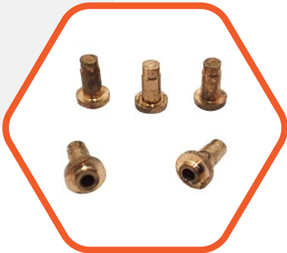
RT 1 Rivet 5 mm Round