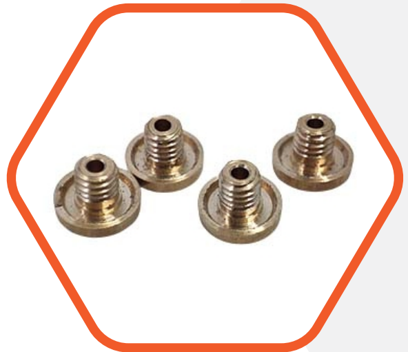
8mm Round Capsule Bush