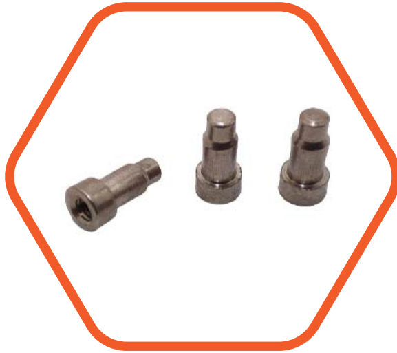
4mm Round Moment Rivet in 2 mm Tapping