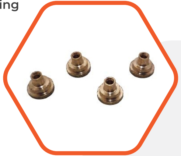
5mm Round Bush