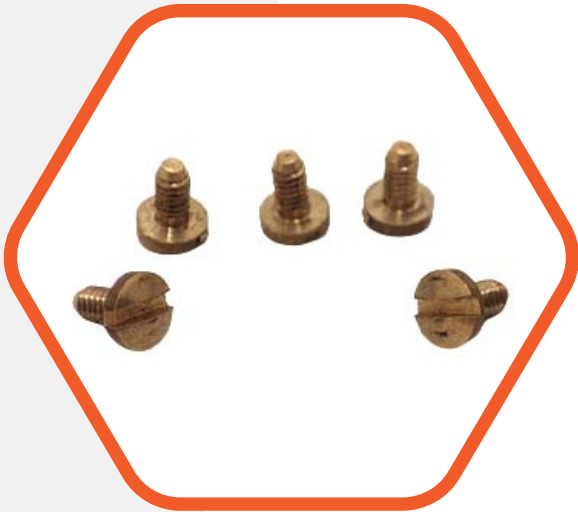
2 mm Dial Screw 4.5 mm Round