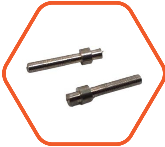
10 Inch Stopper Pin Plated