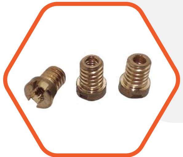
4ba in 2mm Tapping 4.5 mm Round