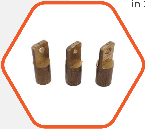
4 mm Talent piece