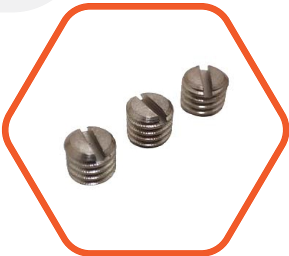
6 mm Grub Screw