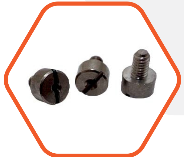
8mm Round 4 mm in 2 mm tapping