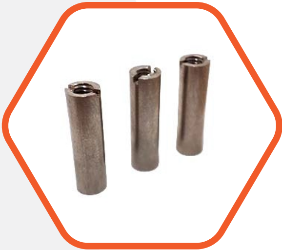
6mm Round 4 mm Tapping Pillar