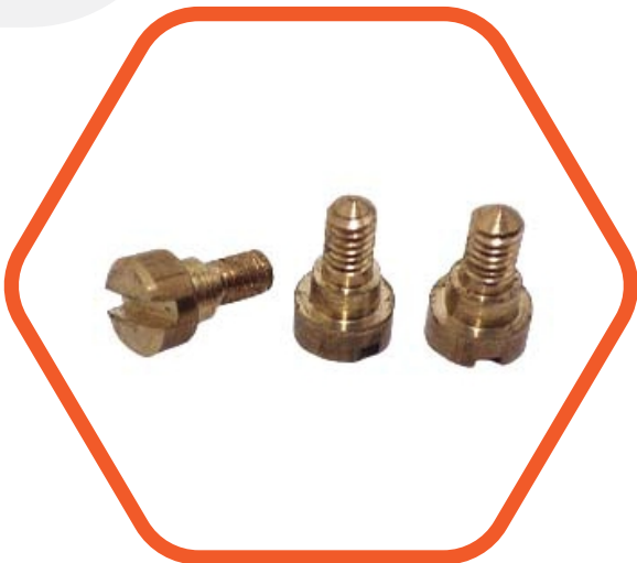
4.5 mm Round Step Screw 2 mm Thread