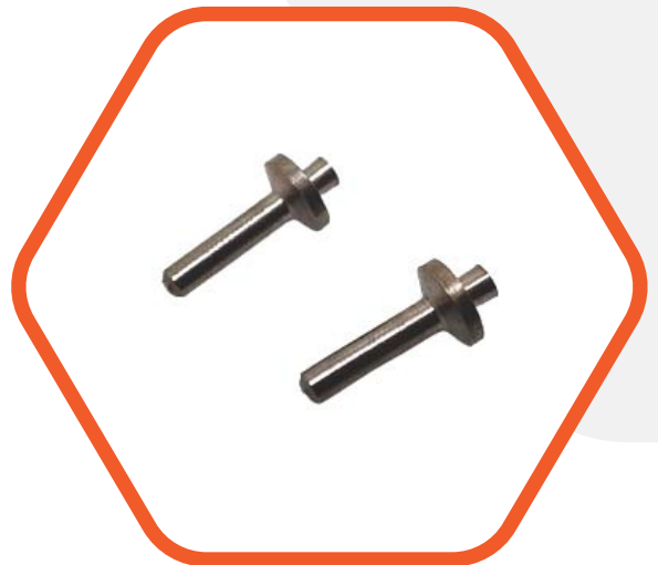
6 inch Heavy Duty Stopper Pin