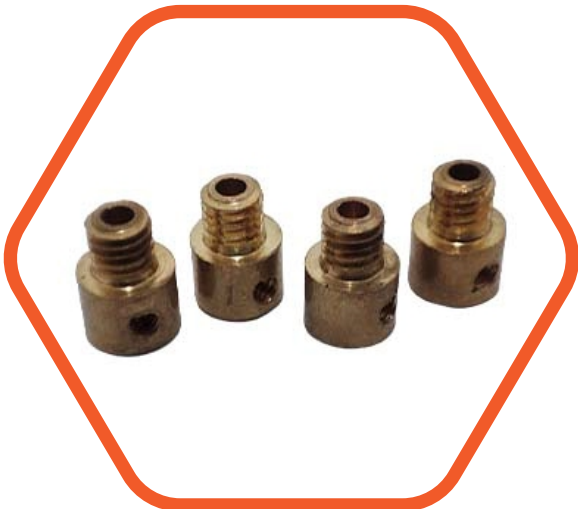
6mm Round M4 Side M2 Tapping