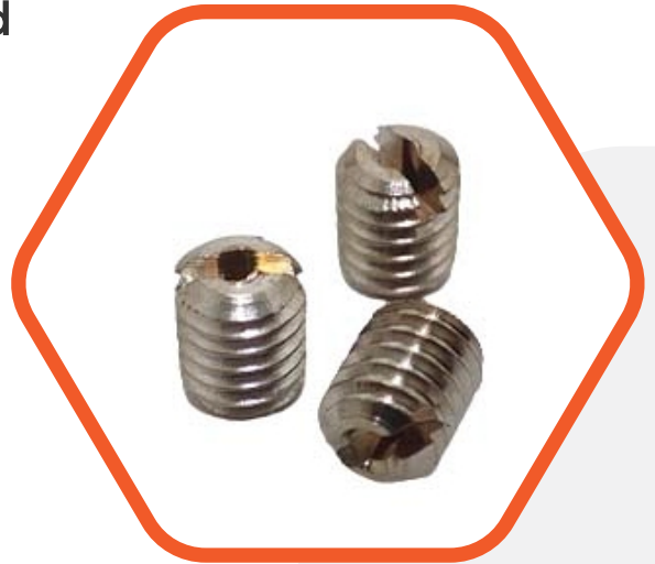
4mm Dumping Screw Plated