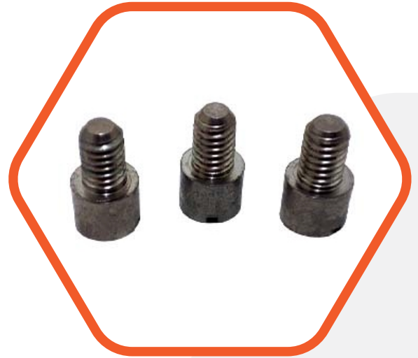
6mm Round 4 mm Thread in 2 mm Tapping Head 5 mm Length